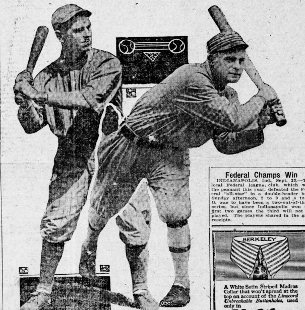
Rube Oldring, the slugging center fielder of the Athletics, and Fred Snodgrass, who fills the same spot for the Giants.

Rube Oldring, of the Athletics, Will Measure Strength With Fred Snodgrass, the Goat of the Sensational Giants-Red Sox Series of 1913