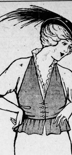
One of the interesting little waistcoats that is made of chambray cloth in taupe color, and is finished with a gathered jibbin below the waist.