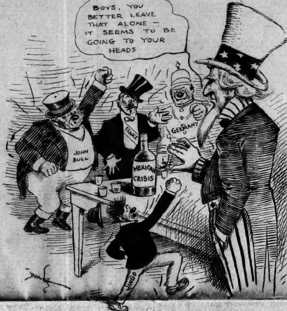
A TIME FOR COOL HEADS.