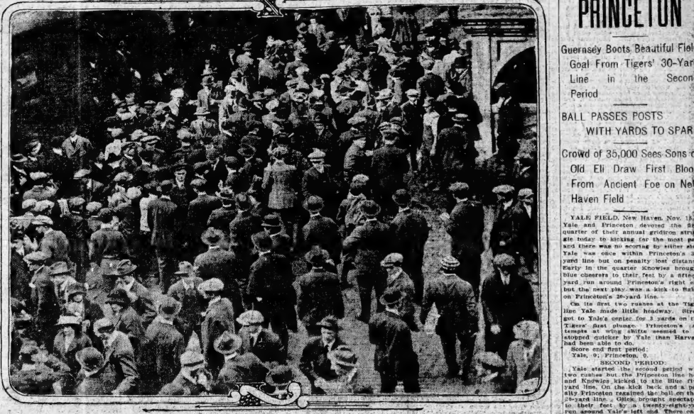
When the variety special rolled into the Union station it brought all Clark county and its suburbs to see Georgia battle with Tech in the annual classic of the Atlanta gridiron.