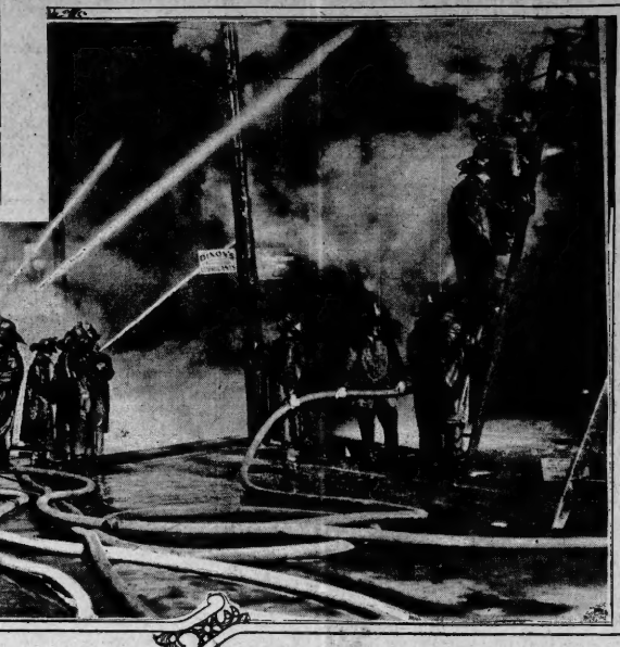
WHOLE FIRE DEPARTMENT AT WORK. View from Forsyth street when the McKensie building was gnawed out by fire in the presence of 2,000 people Sunday afternoon.

The remarkable part about the whole fire was that nobody saw it. Once a spark from the chimney caught on an awning and the entire cloth burst into the biggest blaze of the evening.