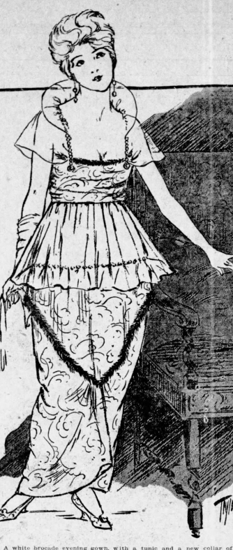
A white brocade evening gown, with a tunic and a new collar of white tulle.