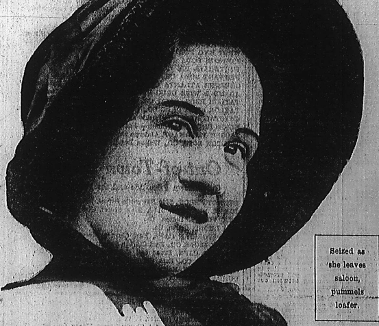
Seized as she leaves saloon, pumelled loafer.

She delights crowd by struggle with man.