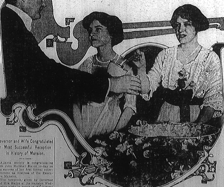
Governor and Wife Congratulated on Most Successful Reception in History of Mansion.